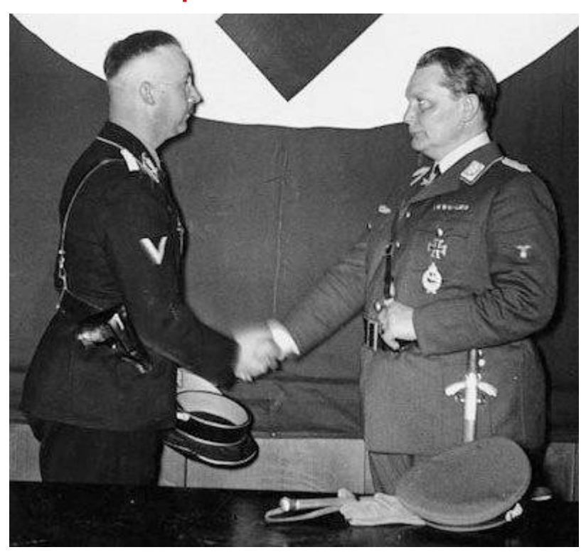
Goring yields control of the Gestapo to Himmler in April 1933